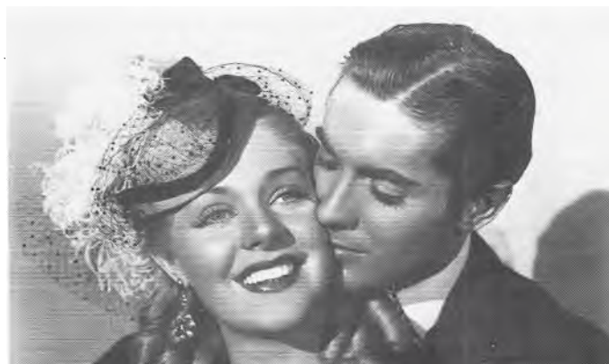
Alice Faye and Tyrone Power in the 1938 release of " IN OLD CHICAGO ." In a clip from this film, Alice sings " Carry Me Back To Old Virginny ."

Some of the songs and stars included in Reel One are: " Carry Me Back to Old Virginny " - first heard as a love duet between Jeanette MacDonald and Nelson Eddy in " Maytime " and then by Alice Faye, as a dance hall queen in the film, " In Old Chicago ." " Easter Parade " first sung by Don Ameche and then Bing Crosby. " Night and Day ," first by Fred Astaire and Ginger Rogers and then Deanna Durbin. " The Last Time I Saw Paris ," as first introduced by Ann Southern and later sung by Dinah Shore. And a rare one: " Sweetheart Waltz " first sung by Jeanette MacDonald in " Sweethearts " and then sung again by Miss MacDonald ten years later in " Three Daring Daughters ." Other stars heard are Dennis Morgan, Ann Sheridan, Roy Rogers, Judy Garland, Betty Grable and John Payne. See you at St. Francis Community Center at 6:00 p.m. on Monday, July 30th!!