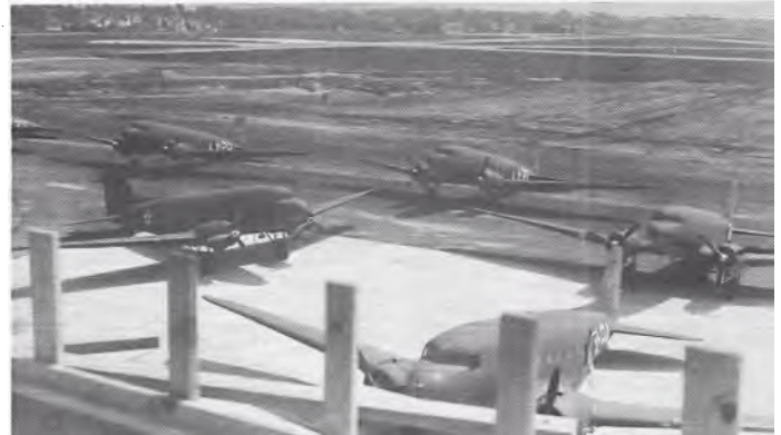
In 1942 (in the above photo), Milwaukee County leased a part of General Mitchell Field to train pilots for the Army Air Force's Air Transport Command. This view from the roof of the National Guard hangar on Howell Avenue shows some of the Douglas C-47 transport planes used in that training. The Northwest Airways hangar and recently built terminal on East Layton Avenue can be seen near the top center of the photo. The photo below shows a close-up of the terminal building from the "field side," shortly after its opening in 1941.

At the time of Charles Augustus Lindbergh's historic 1927 visit to the Town of Lake and Milwaukee County, the county's new airport was a mere shadow of the sprawling complex that exists today. The fledgling facility was comprised of a mere 163 acres, operated out of a farmhouse terminal, and had two runways of compacted cinders which were less than 2,000 feet in length. The recently inaugurated Northwest Airways passenger service used Stinson SB-1 Detroit biplanes which were fitted with skis during winter. The small hangar which Thomas Hamilton had built in 1920 to facilitate his propeller business was shared briefly with