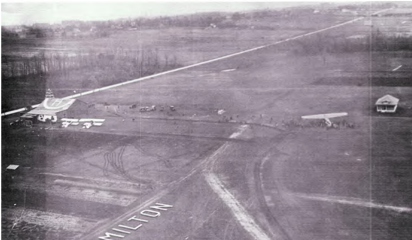
The beginnings of Milwaukee County's Mitchell Airport are shown in the above photo taken October 21, 1926, eight days before the county's purchase of the field from Thomas Hamilton, a propeller and metalplane manufacturer. A Fokker Trimotor, the largest commercial plane in use at the time, is shown at right in the photo. The four stacks of Lakeside Power Plant can be seen near the top center of the photo. By September 13, 1939, the bottom photo shows the runway improvements and construction progress of the new Layton Avenue Air Terminal (center of photo) which opened in 1941.