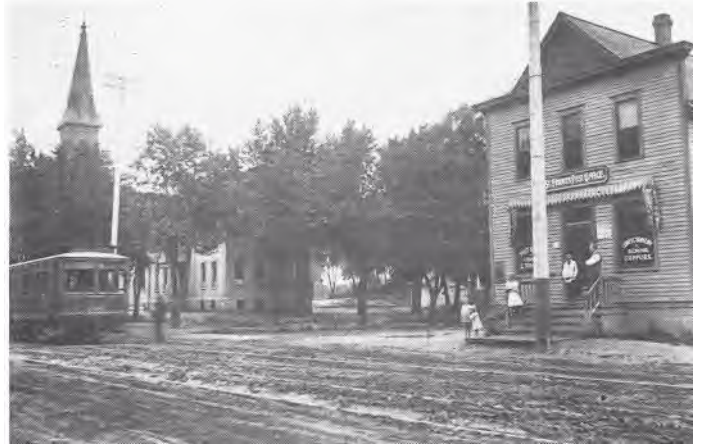
St. Francis Historical Society